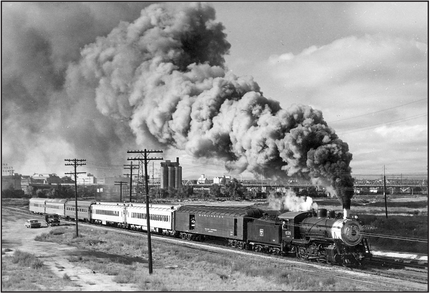
Colorado & Southern 638 leaving Denver with a Rocky Mountain Railroad Club special on September 9, 1962.

family and tourist related activities such as a gunslingers shoot-out at the station and a rodeo which were well attended.