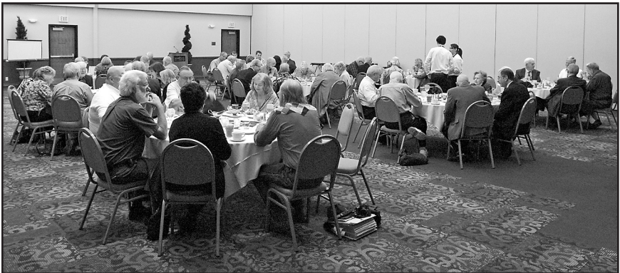
Members enjoy a great lunch at the Arvada Center.