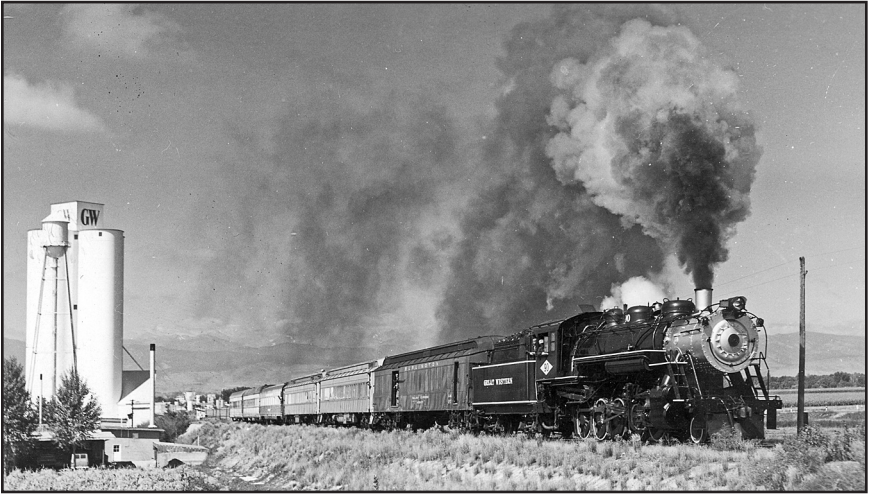
Great Western 90 leaving Longmont, Colorado, with a Rocky Mountain Railroad Club special on September 9, 1962.