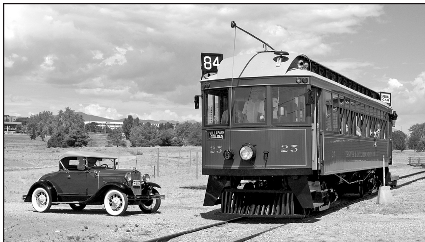
D&IM No. 25 at the open house and roll-out.