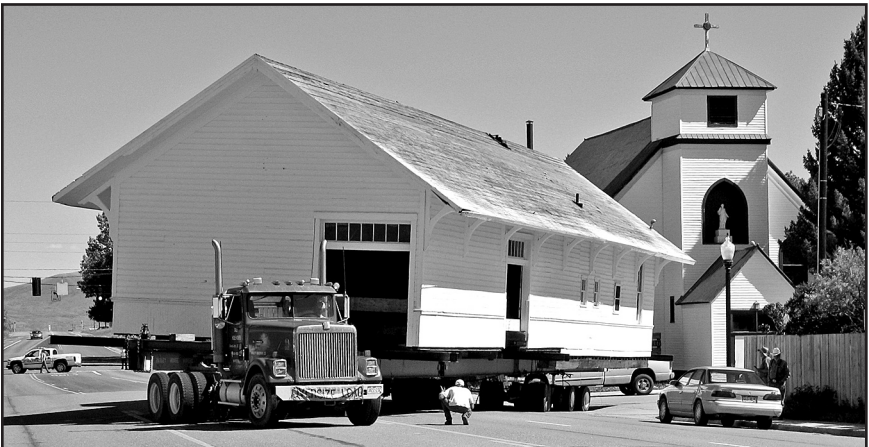
Turning past St. Peter's Catholic Church on to US Hwy 40 (Park Avenue).