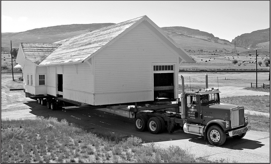
Turning from Depot Street, crossing Gore Avenue heading North on South 5th Street with Gore Canyon in background.