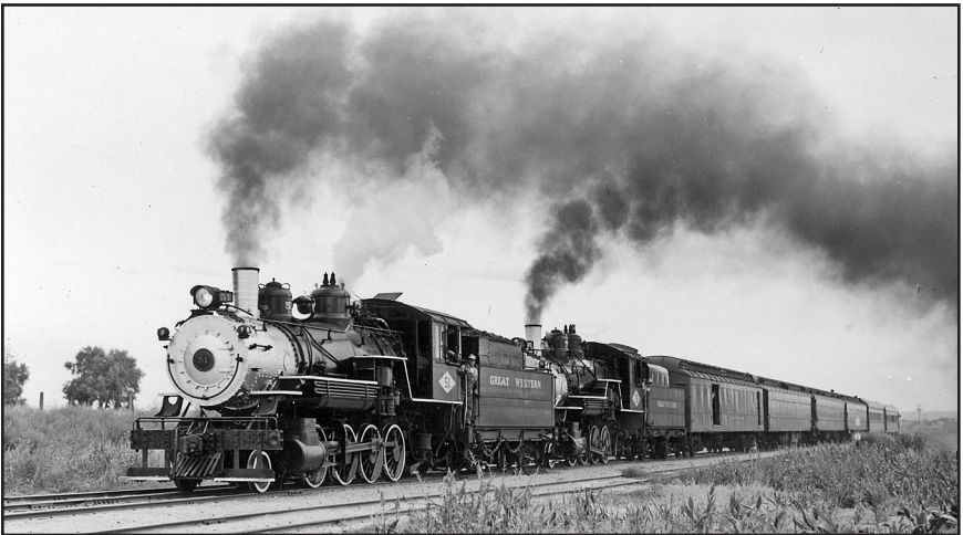
Great Western 51 and 75 at Tuber, Colorado, with a Rocky Mountain Railroad Club special on September 10, 1961.

Members may contact me at: jimrtrain@gmail.com Phone: 307-637-4011 Rocky Mountain RR Club – President PO Box 2391 Denver, CO 80201-2391