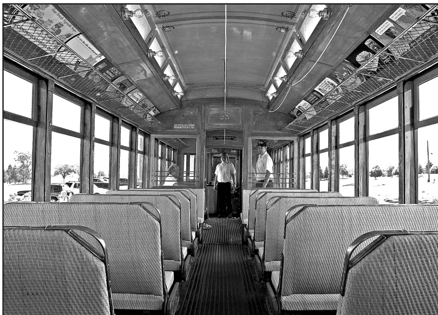
The interior of No. 25.