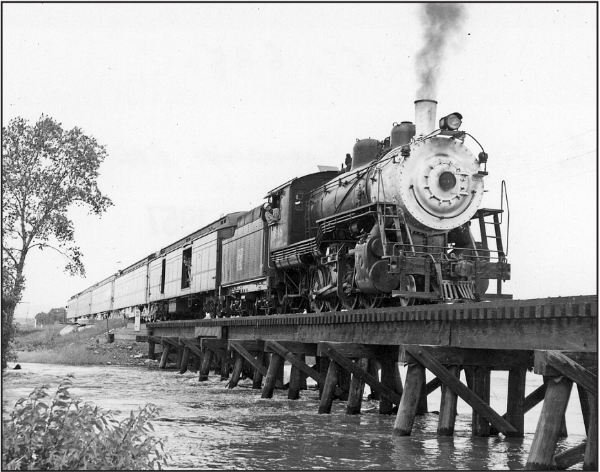
C&S 648 at the Washington Street Road Crossing east of Ft. Collins, Colorado on June 30, 1957.

to Windsor where the GW engine 90 (a 2-10-0) pulled the train to Longmont where the 374 returned the group to Denver.