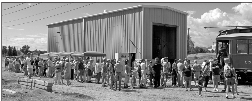
The line of guests waiting to ride D&IM Trolley No. 25 was long most of the day.

attention from generous donors for which we are most grateful.